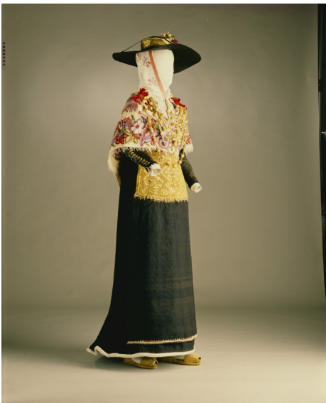
Museo del Traje. CIPE © Miguel Ángel Otero

In the Mediterranean, a region characterized by its hot and humid climate, there is a great diversity of costumes. In Mallorca, the traditional costume of the payés (peasants) consists of short oriental-inspired trousers with multi-coloured stripes and a waistcoat decorated with yellow arabesques and a green belt, over this they put a short black wool waistcoat. The outfit is worn at festivals, especially for the procession of the Beata, in September. In Ibiza, the gonella is part of the typical women's dress. It is a black wool, sleeveless skirt, worn with a formal apron embroidered with colored silks, cuffs with silver buttons and a scarf covered by a broad flat hat. Uniquely in traditional Spanish costume, gold jewellery pinned on the chest represents the dowry of the bride. In addition there might be a necklace of biconic beads, chains and a Christ Crowned with Thorns. The gonella is similar to the basquiña and saigüelo in Ansó and Hecho.