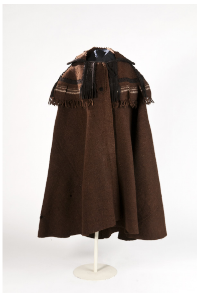
Museo del Traje. CIPE © Javier Maza Domingo

Aesthetically, there is a great deal of difference between the two regions of Aliste and Toro. Because of Aliste's isolated location and the local activity of cattle breeding the population tends to wear brown, lambswool clothes and calfskin shoes (zapatos de oreja). The patterns are archaic and relatively plain, showing traces of 16 th and 17 th century fashions, like the women's sayín. In Toro, on the other hand, wealth is reflected in the profusion of colours and embroidered decoration. There is a folk style, for example, the red saya (a closed skirt) and the skirt known as the zagalejo; there is also a sophisticated style, as exemplified by the black and gold outfit of the «rich widow» (viuda rica) of Toro.