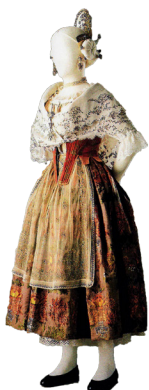
Museo del Traje. CIPE © Museo del Traje

The fabrics, garments and jewellery of this region belong to the history of 18th century costume and Empire fashion, but they also hark back to the history of the silk industry, which was introduced by the Moors. The huertano (market gardener) costume features a number of original elements: brocaded fabrics, stiffened doublets, muslin aprons and scarves embroidered with silver and sequins for the women's shirt-dresses, while men wore the zaragüell, comfortable short trousers in cotton (a throwback to the time of the Moorish presence), and traditional handmade esparto espadrilles.