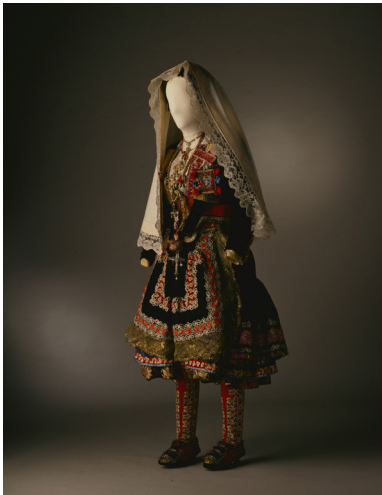
Museo del Traje. CIPE © Lucía Ybarra Zubiaga

In Lagartera, the costume worn for the Corpus Christi ceremony is made up of frayed and embroidered pieces stitched on the balconies typical of that sun-bathed city. This ceremonial costume is made from rich wool and silk fabrics, worked with silk ribbons from Talavera and Valencia, and handmade lace strips of metallic thread (Spanish stitch and banded). The most remarkable of the costumes is that of the bride, a complex outfit with several layers and featuring many symbols of love such as the carnation, the heart and the bouquet prominently displayed on the bust, the only example of this in the world of traditional costumes.