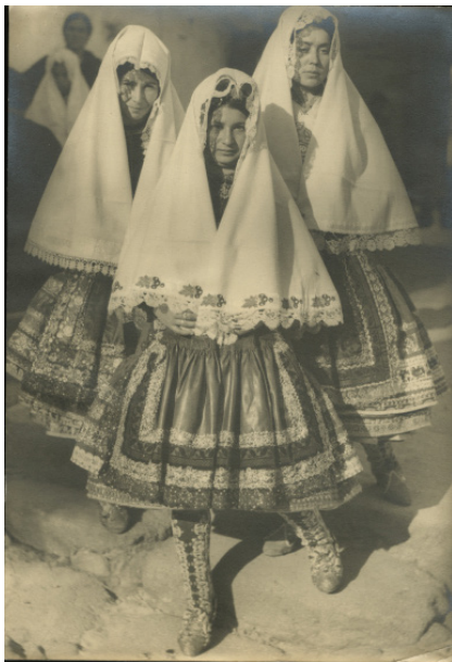
Ortiz Echagüe, José

At times the models refused to wear their ancestors' clothes, maintaining that they could only be worn on feast days. Modern specialists have pointed out that some of the garments correspond neither to the time of the photo nor to the place, and that their state of preservation sometimes suggests that they had never been worn. The photographer's mise-en-scène, they suggest, was both decontextualized and anachronistic. Ortiz Echagüe gave his photographs captions that add to the poetry of his contrived vision of this "rural Arcadia"; it is an eternal, timeless vision of Spain.