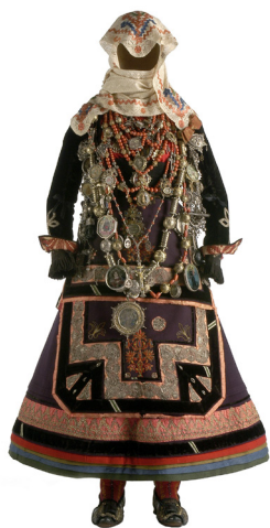
Museo del Traje. CIPE © Lucía Ybarra Zubiaga

It consists of a doublet, a corsage, a scarf, an apron and two dresses; it is characteristic of the Campo Charro area. The floral motifs are hand embroidered with small beads of coloured paste glass, paillettes and mirror chips, and cover the entire surface of the apron.