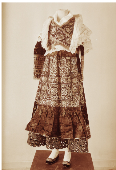
Museo del Traje. CIPE © Museo del Traje

The traditional charro costume, which is typical of the Sierra de Francia area, in Salamanca, was generally worn during folk festivals, especially for weddings. The bridal outfit in La Alberca, capital of the Sierra de Francia area, is distinguished by its colours (brown, pink, silver and gold), but above all by the fact that it is covered in medals, reliquaries, crosses and amulets. A perfect example of baroque aesthetics combined with traditional clothing, this adornment is typically a succession of necklaces in coral and silver gilt and by chains called brazaleras, arranged vertically from the armhole of the doublet. It is an ornamental model, however, inspired for the most part by photographs by José Ortiz Echagüe.