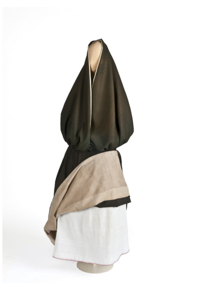
Museo del Traje.

The costume worn in the south of Spain is a far cry from the classic dress with flounces. It shows direct links with the history of the country in that it perpetuates both Castilian costumes and the manto y saya (coat and skirt) or cobijada from Vejer de la Frontera (in the province of Cadiz) – which is not unlike the Muslim niqab. In Alosno (in the province of Huelva), the negative-space embroidery on the shirt is reminiscent of Moroccan embroidery from Fez, while in Almería, the Manila shawl is evidence of the way traditional dress developed towards fashions imported from China. In Granada, the patterns and ornaments in sewn cord, as well as the catite (hat), grew out of romantic fashion.