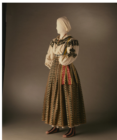
Museo del Traje. CIPE © Museo del Traje

Composed of a saya skirt and a large coat, both in fine black merino wool, the cobijada has a distinctive, large cape which is belted and gathered at the waist to form a long hood that frames the face, leaving only the left eye visible. Documented since the 17th century, its predecessor was the Castilian manto y saya costume, even though it has a Muslim look about it. The Second Spanish Republic forbade it for security reasons, and this is the only authentic old outfit that has been preserved. The cobijada was revived in 1976 and is the costume worn nowadays for the religious holidays in August