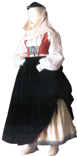
Woman's costume from Santa Cruz de la Palma (La Palma, Santa Cruz de Tenerife) 1880-1925

Located in the Atlantic Ocean, a long way from the Iberian peninsula, these islands remained relatively isolated from one another. Although they enjoy a temperate, constant climate, some are desert islands and volcanic. Today, silkworms and cochineal are bred, the latter for use as a natural dye. There are various local items of clothing: woollen petticoats woven on a loom, waistcoats and scarves in silk woven on the Canary Islands, hats made of palm straw, toques of various types, and also camel-hide garments. There is also a lace and embroidery industry, both of which are used to decorate typical petticoats, shirts and other products, on these islands. These garments are particularly in evidence at the feast of the Virgin of Candelaria, the main celebration on the Canaries, which takes place on February 2.