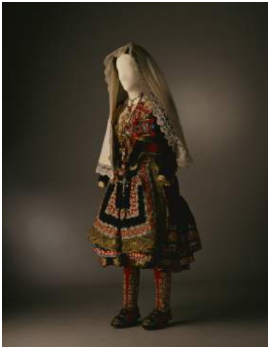
Museo del Traje. CIPE © Lucía Ybarra Zubiaga

In Lagartera, the costume worn for the Corpus Christi ceremony is made up of frayed and embroidered pieces stitched on the balconies typical of that sun-bathed city. This ceremonial costume is made from rich wool and silk fabrics, worked with silk ribbons from Talavera and Valencia, and handmade lace strips of metallic thread (Spanish stitch and banded). The most remarkable of the costumes is that of the bride, a complex outfit with several layers and featuring many symbols of love such as the carnation, the heart and the bouquet prominently displayed on the bust, the only example of this in the world of traditional costumes.