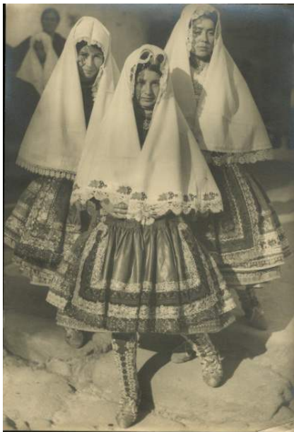
Ortiz Echagüe, José

At times the models refused to wear their ancestors' clothes, maintaining that they could only be worn on feast days. Modern specialists have pointed out that some of the garments correspond neither to the time of the photo nor to the place, and that their state of preservation sometimes suggests that they had never been worn. The photographer's mise-en-scène, they suggest, was both decontextualized and anachronistic. Ortiz Echagüe gave his photographs captions that add to the poetry of his contrived vision of this "rural Arcadia"; it is an eternal, timeless vision of Spain.