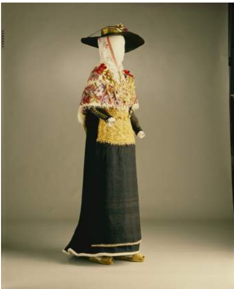
Museo del Traje. CIPE © Miguel Ángel Otero

In the Mediterranean, a region characterized by its hot and humid climate, there is a great diversity of costumes. In Mallorca, the traditional costume of the payés (peasants) consists of short oriental-inspired trousers with multi-coloured stripes and a waistcoat decorated with yellow arabesques and a green belt, over this they put a short black wool waistcoat. The outfit is worn at festivals, especially for the procession of the Beata, in September. In Ibiza, the gonella is part of the typical women's dress. It is a black wool, sleeveless skirt, worn with a formal apron embroidered with colored silks, cuffs with silver buttons and a scarf covered by a broad flat hat. Uniquely in traditional Spanish costume, gold jewellery pinned on the chest represents the dowry of the bride. In addition there might be a necklace of biconic beads, chains and a Christ Crowned with Thorns. The gonella is similar to the basquiña and saigüelo in Ansó and Hecho.