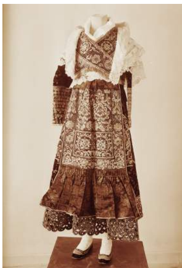
Museo del Traje.

The traditional charro costume, which is typical of the Sierra de Francia area, in Salamanca, was generally worn during folk festivals, especially for weddings. The bridal outfit in La Alberca, capital of the Sierra de Francia area, is distinguished by its colours (brown, pink, silver and gold), but above all by the fact that it is covered in medals, reliquaries, crosses and amulets. A perfect example of baroque aesthetics combined with traditional clothing, this adornment is typically a succession of necklaces in coral and silver gilt and by chains called brazaleras, arranged vertically from the armhole of the doublet. It is an ornamental model, however, inspired for the most part by photographs by José Ortiz Echagüe.