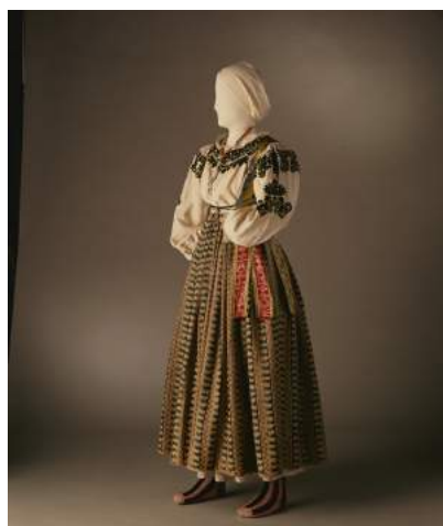
Museo del Traje. CIPE © Museo del Traje

Composed of a saya skirt and a large coat, both in fine black merino wool, the cobijada has a distinctive, large cape which is belted and gathered at the waist to form a long hood that frames the face, leaving only the left eye visible. Documented since the 17th century, its predecessor was the Castilian manto y saya costume, even though it has a Muslim look about it. The Second Spanish Republic forbade it for security reasons, and this is the only authentic old outfit that has been preserved. The cobijada was revived in 1976 and is the costume worn nowadays for the religious holidays in August