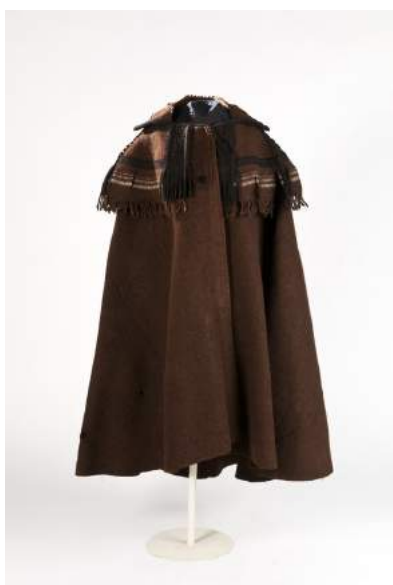
Museo del Traje. CIPE

Aesthetically, there is a great deal of difference between the two regions of Aliste and Toro. Because of Aliste's isolated location and the local activity of cattle breeding the population tends to wear brown, lambswool clothes and calfskin shoes (zapatos de oreja). The patterns are archaic and relatively plain, showing traces of 16 th and 17 th century fashions, like the women's sayín. In Toro, on the other hand, wealth is reflected in the profusion of colours and embroidered decoration. There is a folk style, for example, the red saya (a closed skirt) and the skirt known as the zagalejo; there is also a sophisticated style, as exemplified by the black and gold outfit of the «rich widow» (viuda rica) of Toro.