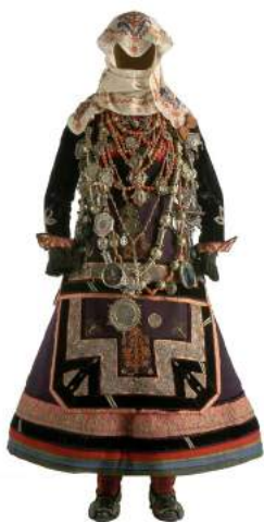
Museo del Traje. CIPE © Lucía Ybarra Zubiaga

It consists of a doublet, a corsage, a scarf, an apron and two dresses; it is characteristic of the Campo Charro area. The floral motifs are hand embroidered with small beads of coloured paste glass, paillettes and mirror chips, and cover the entire surface of the apron.