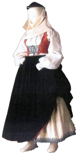
Woman's costume from Santa Cruz de la Palma (La Palma, Santa Cruz de Tenerife) 1880-1925

Located in the Atlantic Ocean, a long way from the Iberian peninsula, these islands remained relatively isolated from one another. Although they enjoy a temperate, constant climate, some are desert islands and volcanic. Today, silkworms and cochineal are bred, the latter for use as a natural dye. There are various local items of clothing: woollen petticoats woven on a loom, waistcoats and scarves in silk woven on the Canary Islands, hats made of palm straw, toques of various types, and also camel-hide garments. There is also a lace and embroidery industry, both of which are used to decorate typical petticoats, shirts and other products, on these islands. These garments are particularly in evidence at the feast of the Virgin of Candelaria, the main celebration on the Canaries, which takes place on February 2.