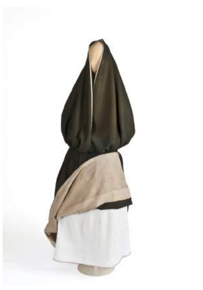
Museo del Traje.

The costume worn in the south of Spain is a far cry from the classic dress with flounces. It shows direct links with the history of the country in that it perpetuates both Castilian costumes and the manto y saya (coat and skirt) or cobijada from Vejer de la Frontera (in the province of Cadiz) – which is not unlike the Muslim niqab. In Alosno (in the province of Huelva), the negative-space embroidery on the shirt is reminiscent of Moroccan embroidery from Fez, while in Almería, the Manila shawl is evidence of the way traditional dress developed towards fashions imported from China. In Granada, the patterns and ornaments in sewn cord, as well as the catite (hat), grew out of romantic fashion.